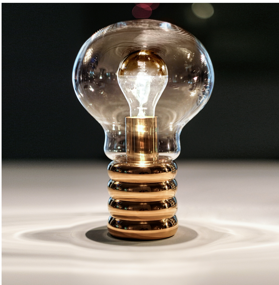
Bulb Brass INGO MAURER TEAM 2021

Brass base, mouth blown Murano crystal glass. Bulb Brass is the new member of the Ingo Maurer Bulb family. Based on the world-famous 1966 design, the Ingo Maurer team developed a brass version. The handcrafted lamp base is made of high quality brass. The untreated brass surface tends to change over time, giving it a special character. A patina is created, a surface change by natural aging. Patina is the result of daily use and is perceived as an aesthetic gain, as it stands for a characteristic material property that can ultimately be understood as the individual signature of the user.